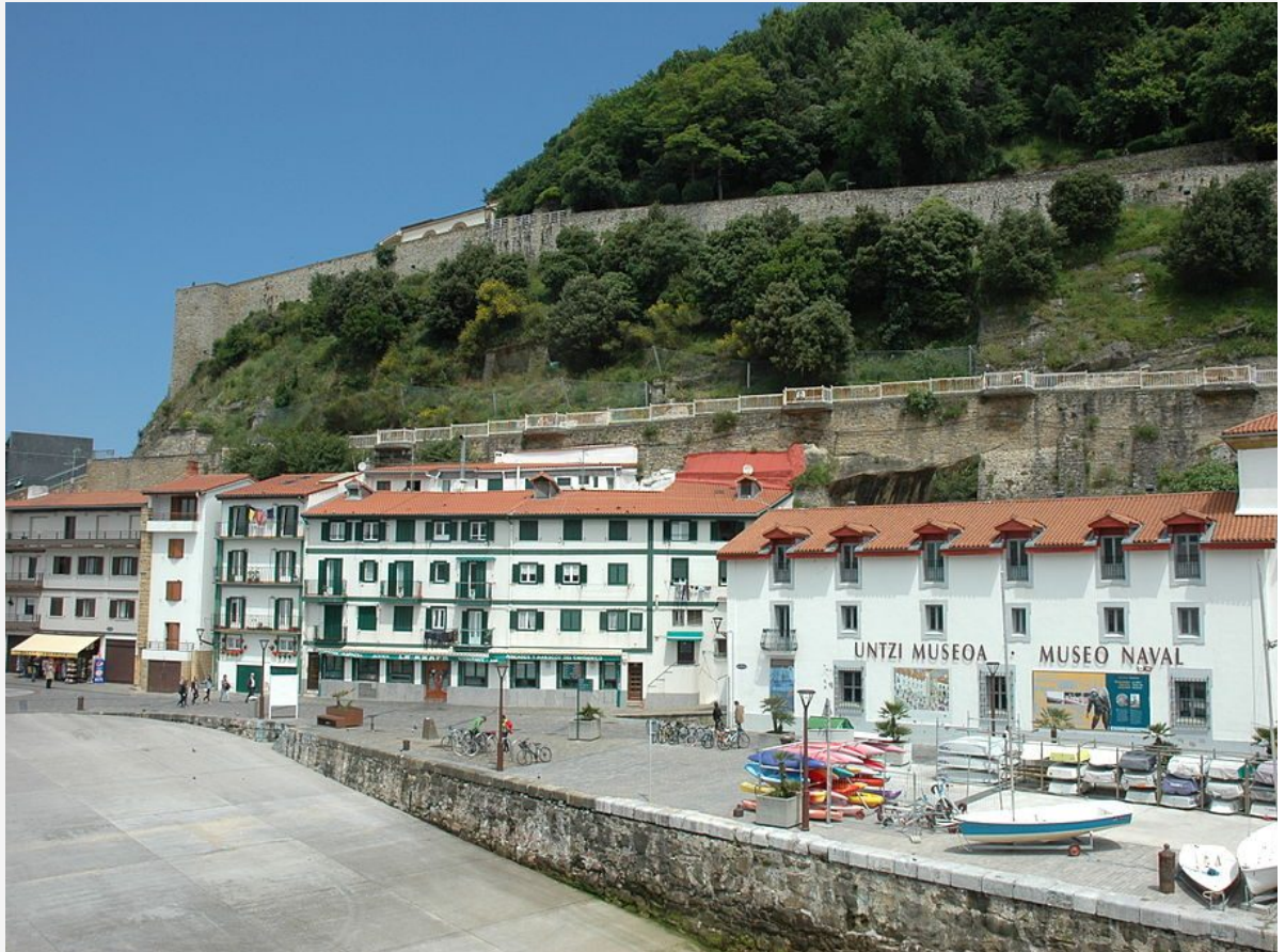
Museo Naval, San Sebastian

Kaiko Pasealekua, 24, San Sebastián, Guipúzcoa, Spain +34 943 43 00 51