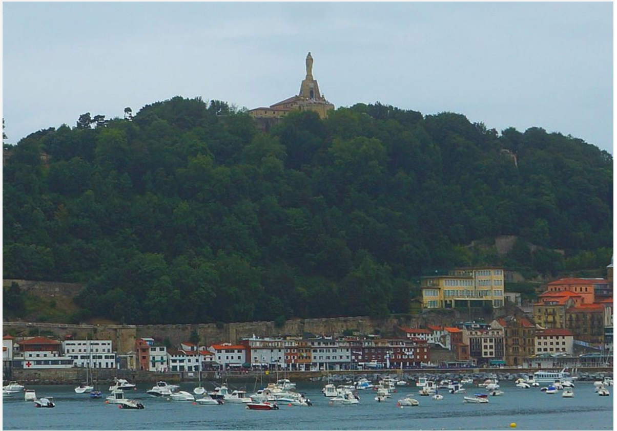
Monte Urgull and Castillo de La Mota, San Sebastian

Subida al Castillo Kalea, San Sebastián, Guipúzcoa, Spain +34 943 48 11 66