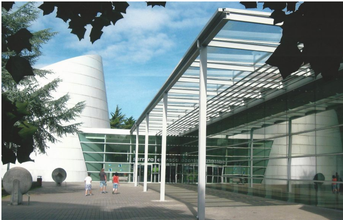
Eureka Zientzia Museoa, San Sebastian