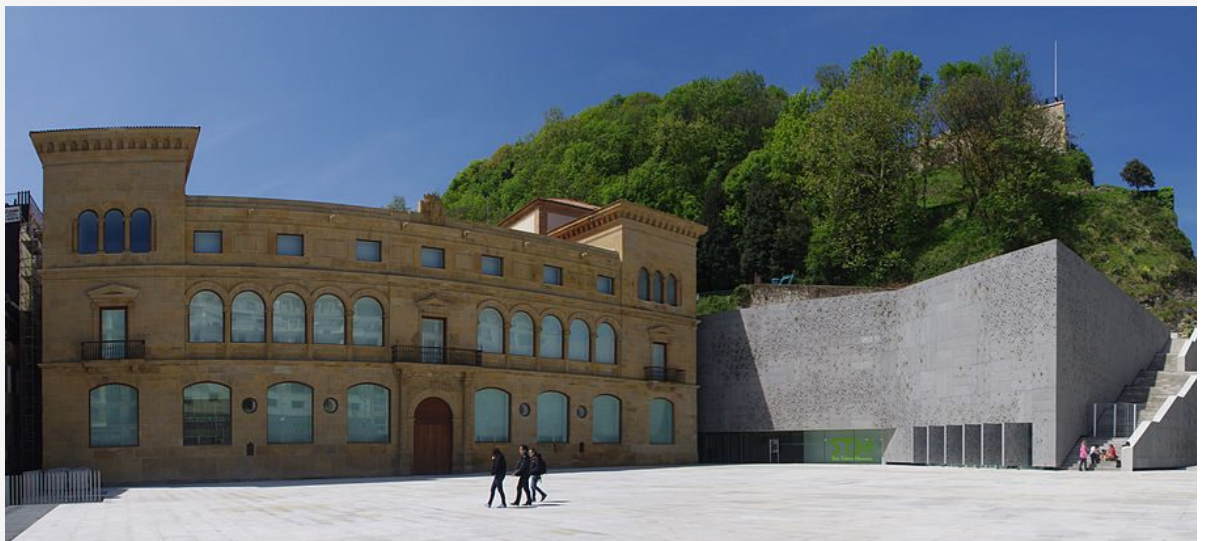
Museo San Telmo, San Sebastian | © Gonzalomauleon / Wikimedia Commons

Plaza Zuloaga, 1, San Sebastián, Guipúzcoa, Spain +34 943 48 15 80