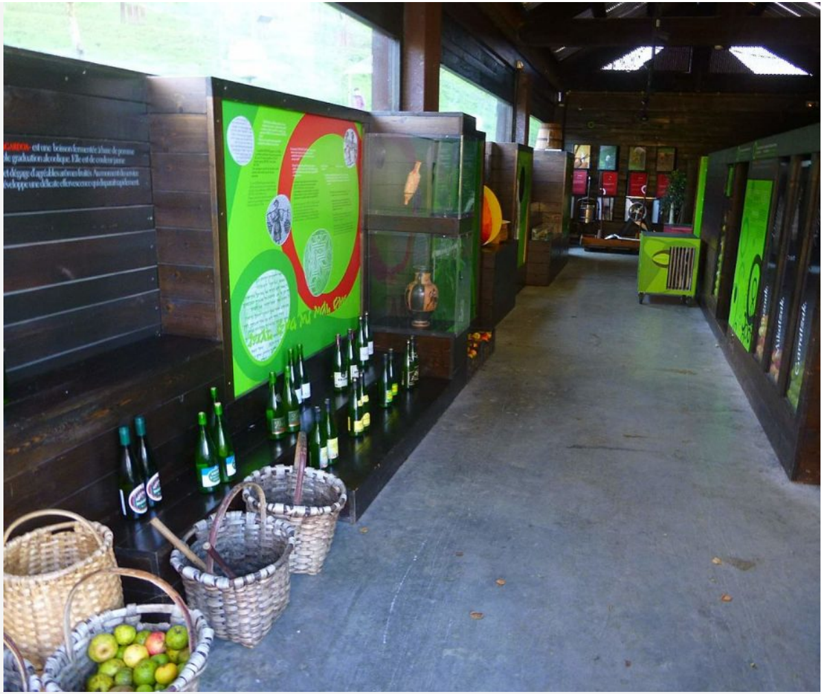
Sagardoebea cider museum