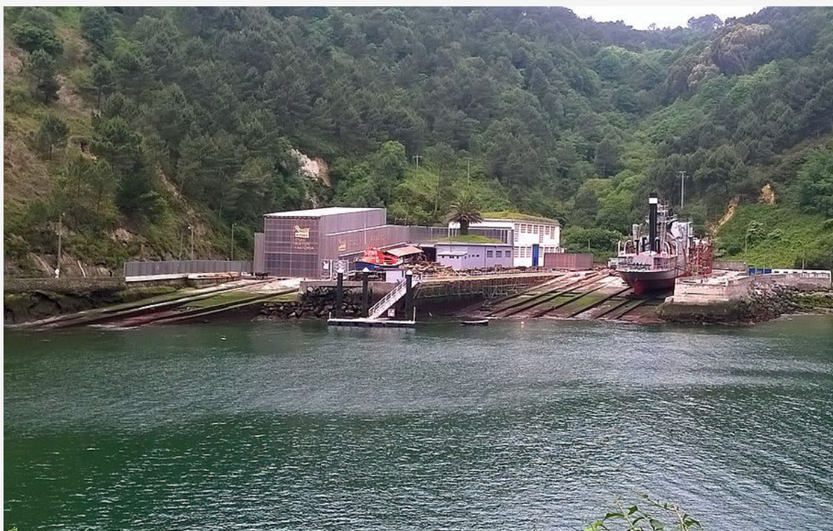
La Factoria Albaola, San Pedro | © Euskaldunak / Wikimedia Commons

Ondartxo, 1, Pasai San Pedro, Guipúzcoa, Spain +34 943 39 24 26