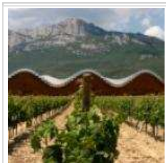
Wine Touring in Spain's Rioja Region