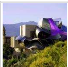
Architectural Wonders in the Rioja Region of Spain

Previous Post: « « Barcelona's Treasures: its Art and Architecture Next Post: Exploring the Dutch Coast » »