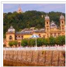
Taste the Greatest Food in Europe in San Sebastian, Spain