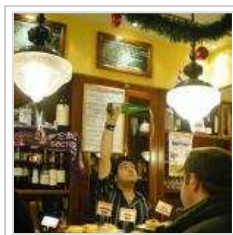
Up Close Picture of the Week: A Cider Pour in Basque Spain