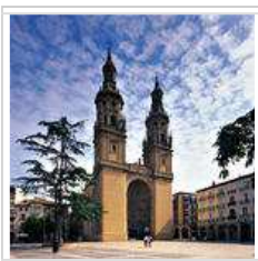
Spain's Best Culinary Experiences