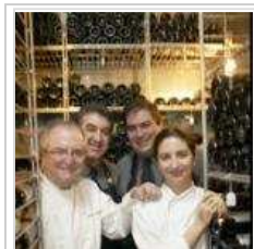
San Sebastian – Sun, Sea and Superb Cuisine