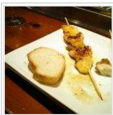
A Tapas Tour of Northern Spain